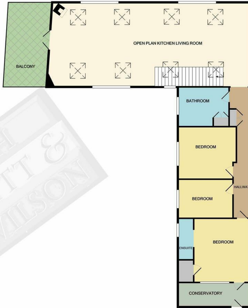
1ST FLOOR APPROX. FLOOR AREA 1529 SQ.FT. (142.0 SQ.M.)