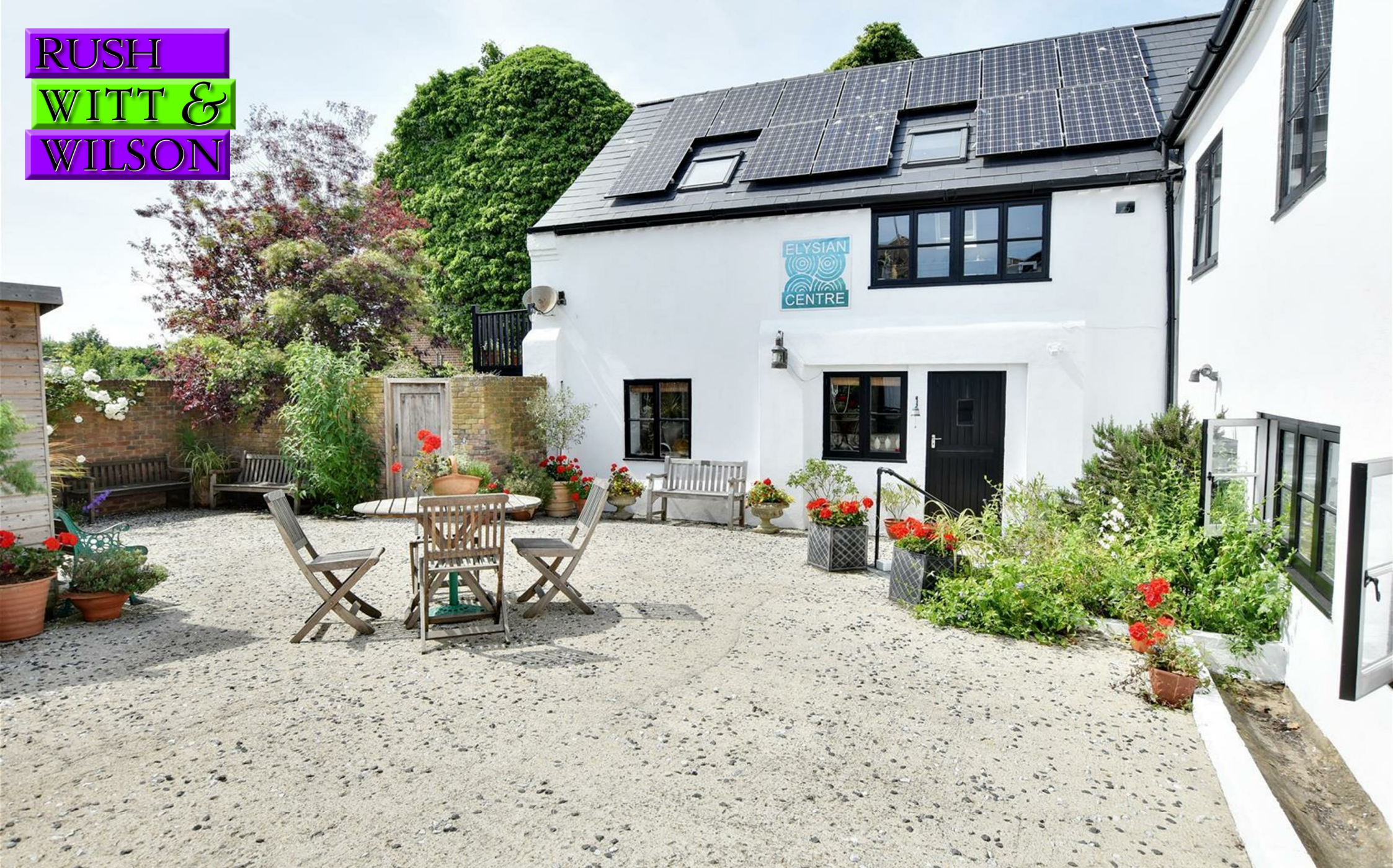
The Workhouse 18 Cinque Ports Street, Rye, East Sussex TN31 7AD Guide Price £1,100,000